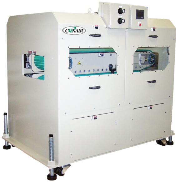
Model BP 8-48 Shown with custom enclosure