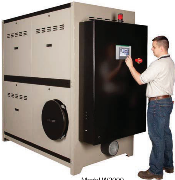
Model W2000 (shown with optional DC-T control)